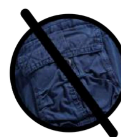
No Cargo Pockets