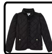
Solid Jacket Navy, Black, Gray, or White