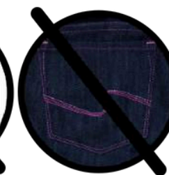
No Patch Pockets & No Outside Stitching

Shirts: Polo or Oxford in light blue, grey or white WITH the logo.