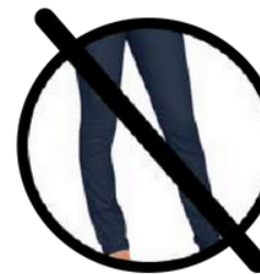
No Fitted Pants or Shorts