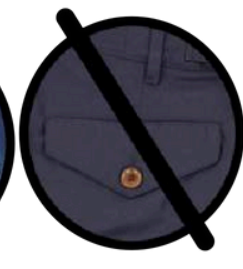
No Button/Flap Pockets