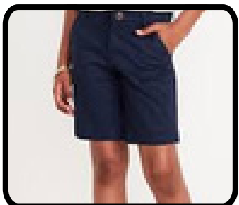
Shorts no more than 4" above knee